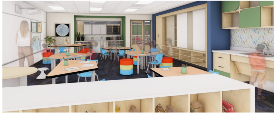
Rendering of DeKeyser Elementary classroom.

The projects also included the reconstruction of DeKeyser Elementary as a first step towards reimagining how the school