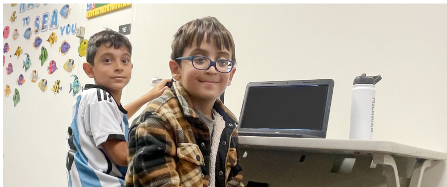
Formerly referred to as an “Open Concept” school, walls were installed at Schuchard Elementary to create an additional layer of safety for students and staff.